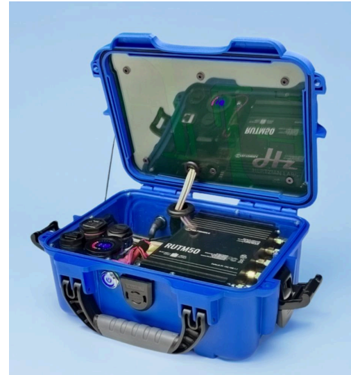
CM1 (clear body panels)